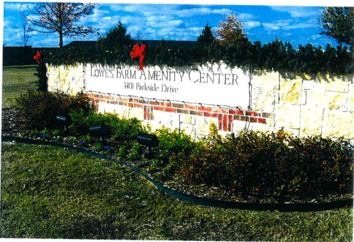
View of Amenity Center Entrance Monument/Signage

PROPERTY : LOWES FARM HOMEOWNERS ASSOCIATION Location No. 1 : Common Amenity Center, 1401 Parkside Drive