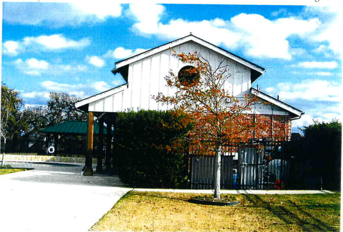
Side Elevation of Amenity Center Bath House Building