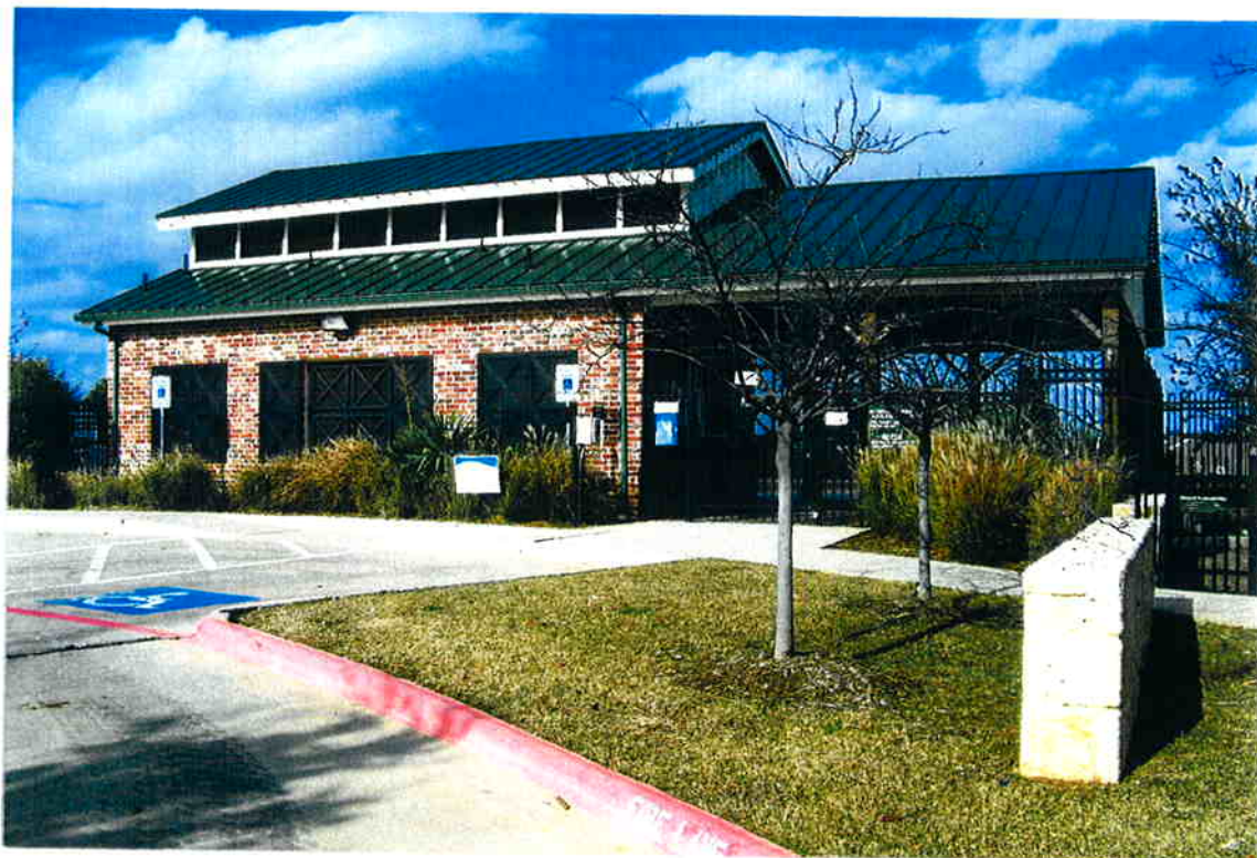
Front (Entrance) Elevation of Amenity Center Bath House Building