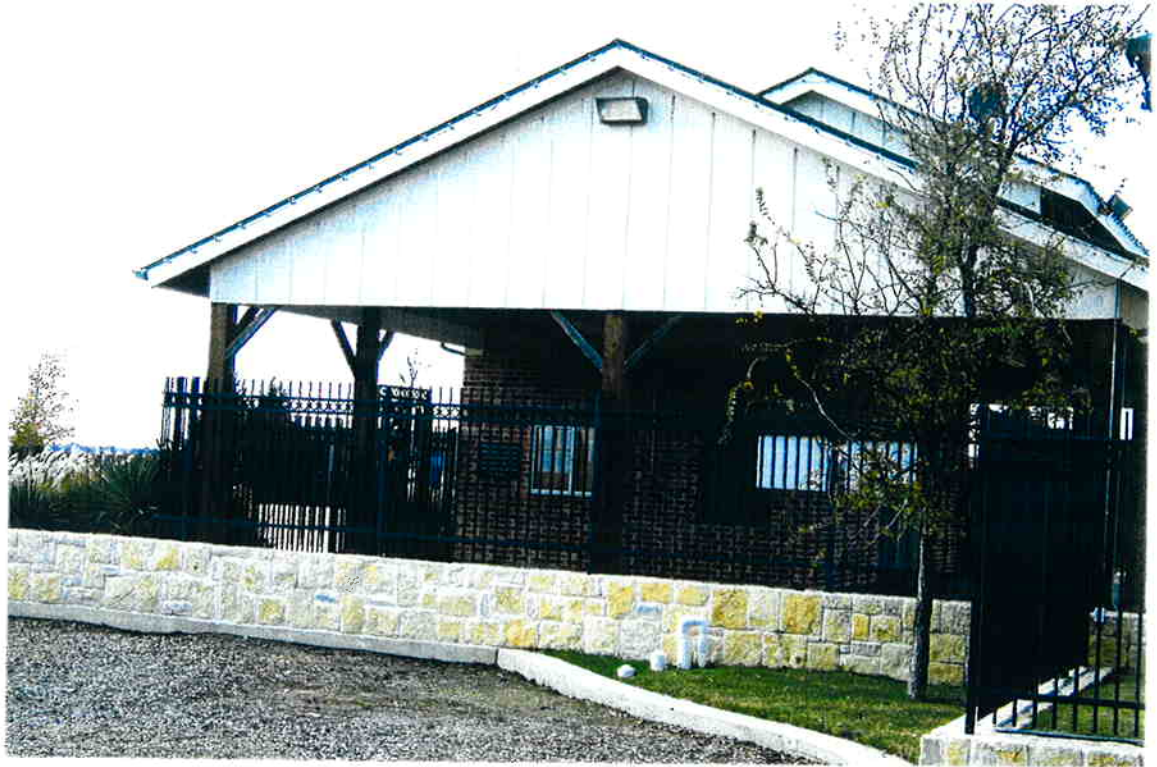
Side Elevation of Amenity Center Bath House Building

PROPERTY : LOWES FARM HOMEOWNERS ASSOCIATION Location No. 1 : Common Amenity Center, 1401 Parkside Drive