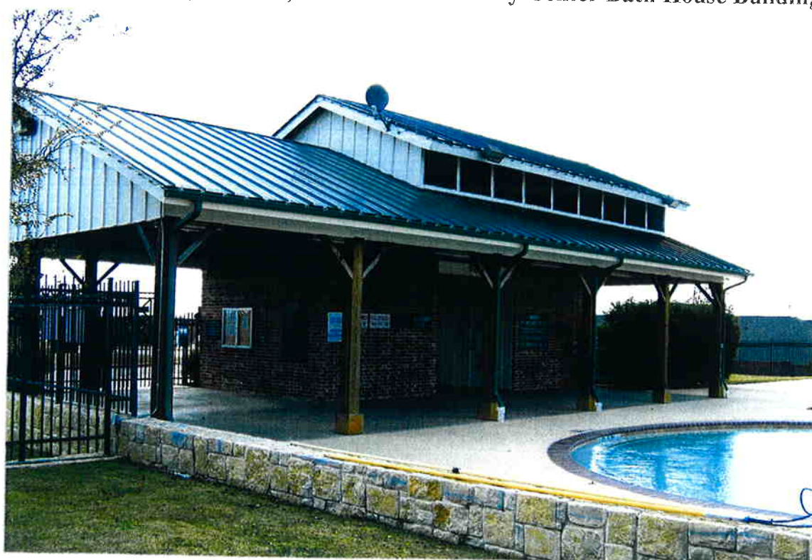
Back (Poolside) Elevation of Amenity Center Bath House Building