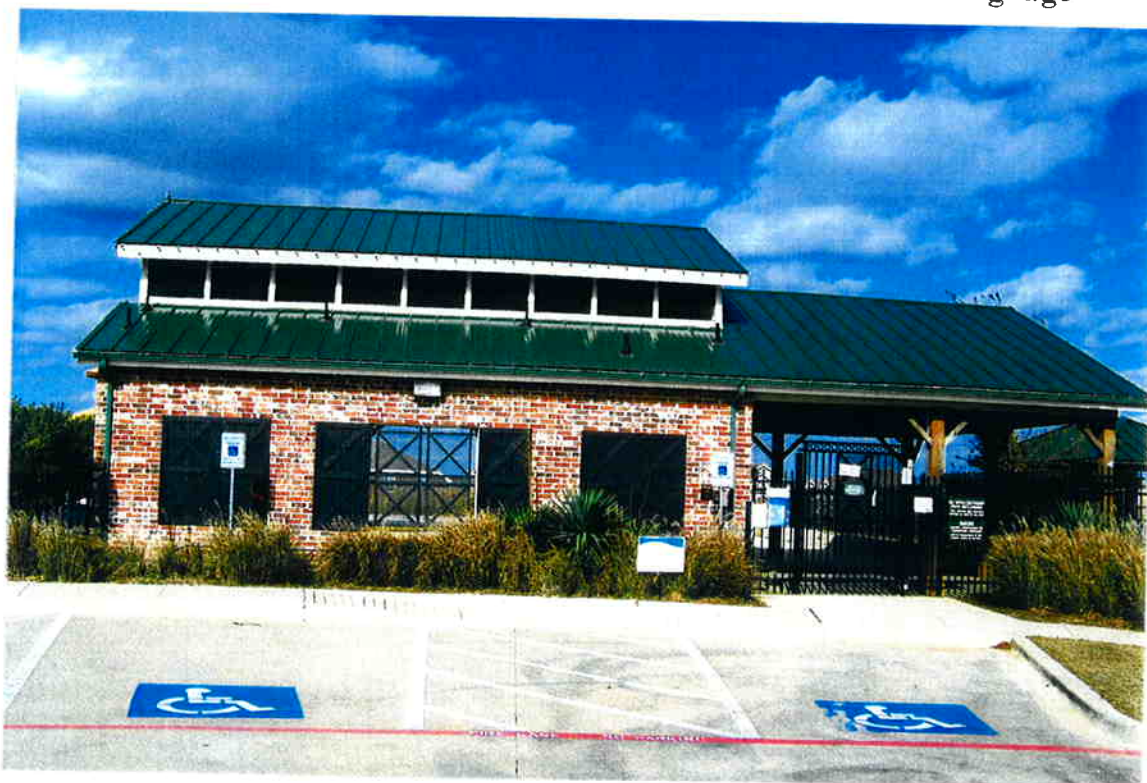
Front (Entrance) Elevation of Amenity Center Bath House Building